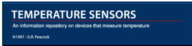
Figure 2. Original Logo Designed for About Temperature Sensors (by Anonymous Productions )

It was such a personally rewarding experience that in 1997 About Temperature Sensors got its own URL, http://www.temperatures.com/ , on a separate, paid, hosting service. My honorarium from ISA for the courses I taught more than paid the costs for the website. My son Matt created a banner for the site shown in Figure 2, that still resides on many of its pages.